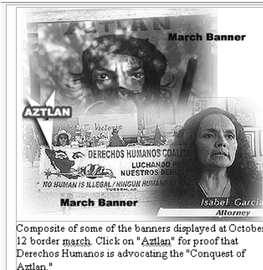
Composite of some of the banners displayed at October 12 border march. Click on "Aztlan" for proof that Derechos Humanos is advocating the "Conquest of Aztlan."