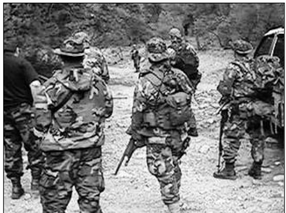
Vigilantes on patrol with Ranch Rescue's October 2002 Operation Hawk.