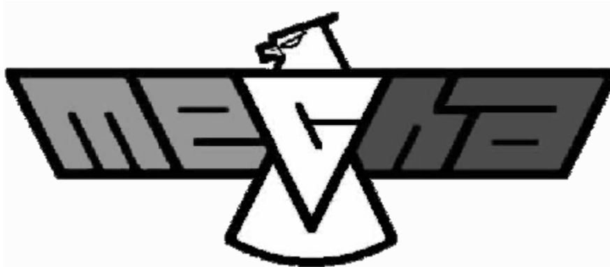
American Border Patrol manipulates the MEChA logo on their web page.

The American Border Patrol goes so far as to interpret the mainstream Chicano student organization, MEChA, as a radical revolutionary sect, poised to reclaim Aztlán by force. Anyone familiar with MEChA would not only find this unlikely, but also understand it as solid evidence that these anti-immigrant groups are seriously misinterpreting their data.